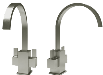
5008BF Brushed Chrome